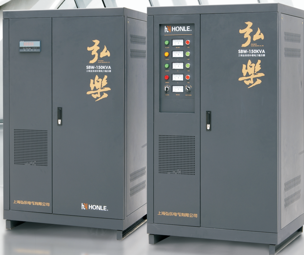
DBW/SBW series large power full automatic compensated voltage stabilizer